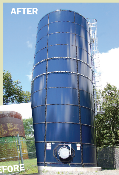
Above: A 100,000 gallon storage tank in Wild Acres Development was replaced in 2013 at an approximate cost of $484,000 to increase reliability for customers.

For more information: To explore which public-private partnership opportunity makes most sense for your community in Pennsylvania, contact Bernie Grundusky at 717-790-3024.