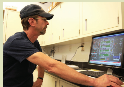
Above: Saw Creek Wastewater Treatment Facility, Lehman Township, Pike County, installed a new Supervisory Control and Data Acquisition system (SCADA) as part of its $2.5 million improvement project. This technology allows plant operators to monitor plant operations and control them from a centralized location, including chemical feed systems.

Pennsylvania American Water's footprint in Monroe and Pike counties continues to grow. Each system we acquired faced unique service issues and environmental challenges, ranging from lack of water supply to wells that were contaminated with gasoline, that required immediate investment.