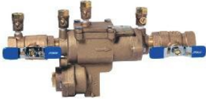
Reduced Pressure Principle Backflow Prevention Assembly (RPZ)