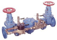
Double check detector assembly (DCDA)