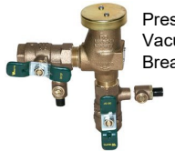
Pressure Vacuum Breaker (PVB)